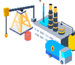
Safety Inspection Solution