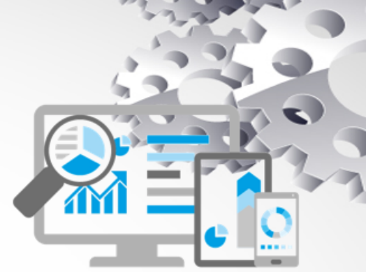
State-of-the-art IT Solutions