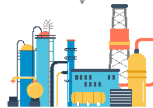
Field Service Management Solution