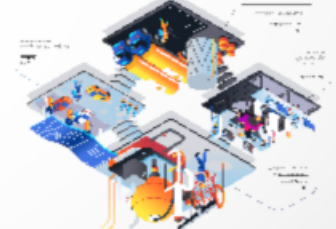
Field Service Reporting and Analytics