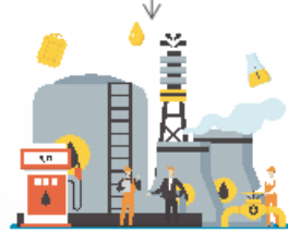
Shutdowns, Turnarounds and Outages